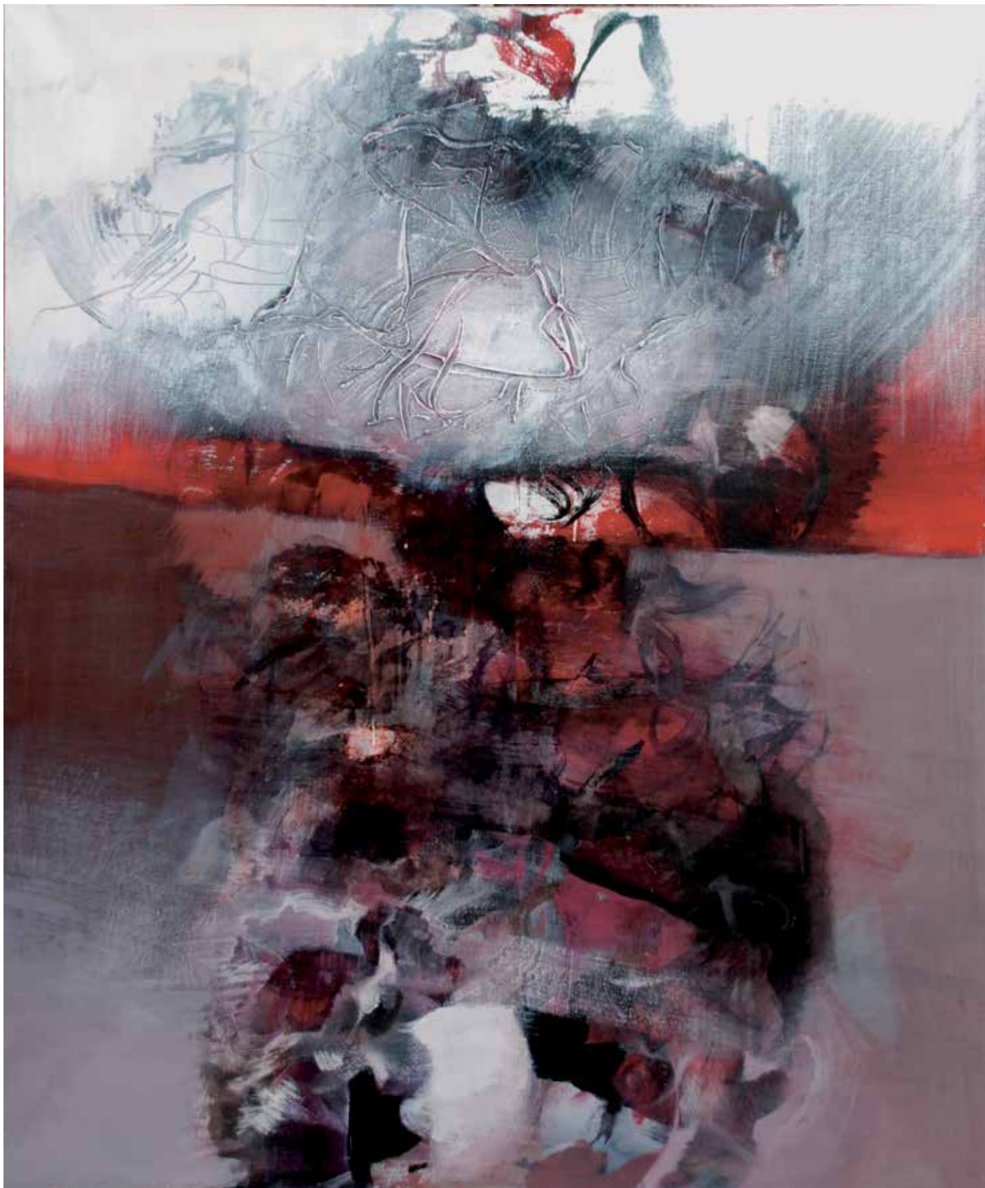
Tracce e ossessioni , 2016. Tecnica mista su tela, 120x100 cm