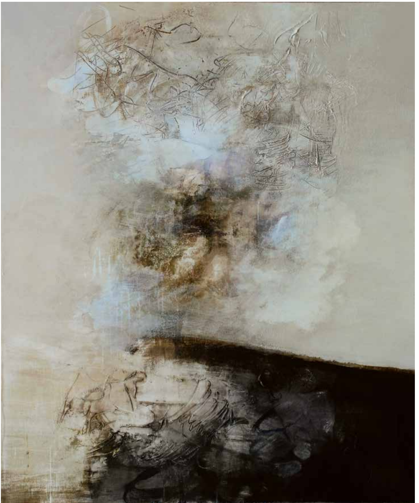
Cercosia , 2016. Tecnica mista su tela, 120x100 cm