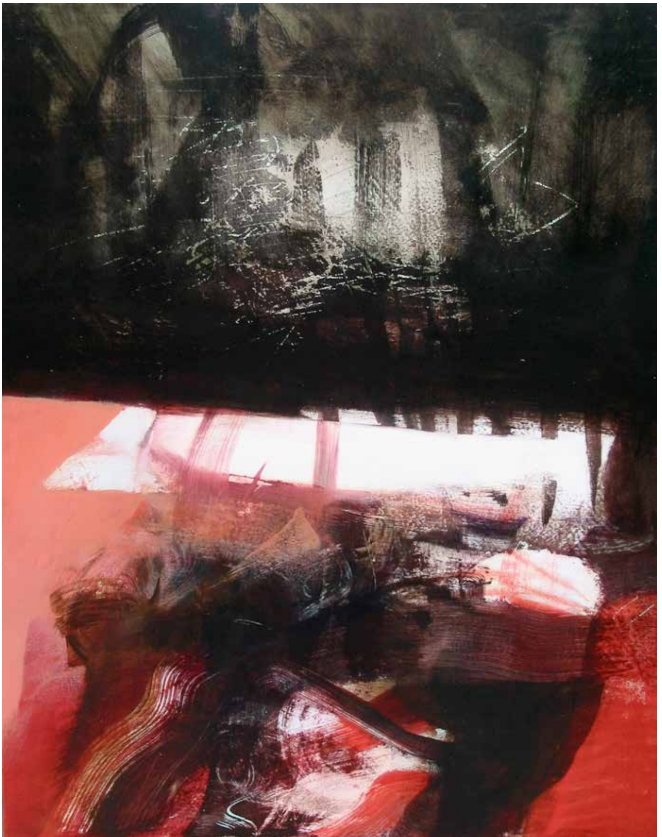
Nuova ossessione , 2005. Acrilico su tela, 100x80 cm