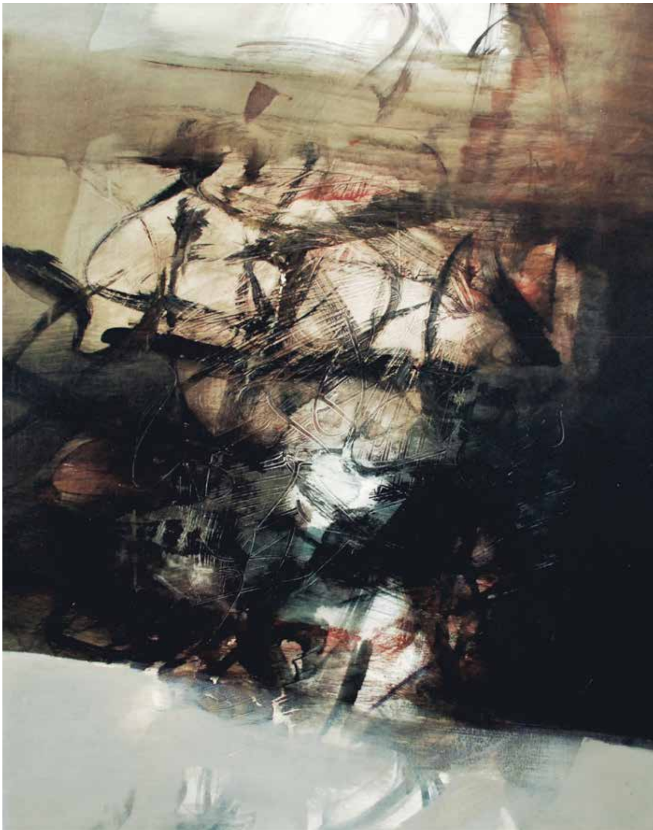
Fuori controllo , 2010. Tecnica mista su tela, 100x80 cm