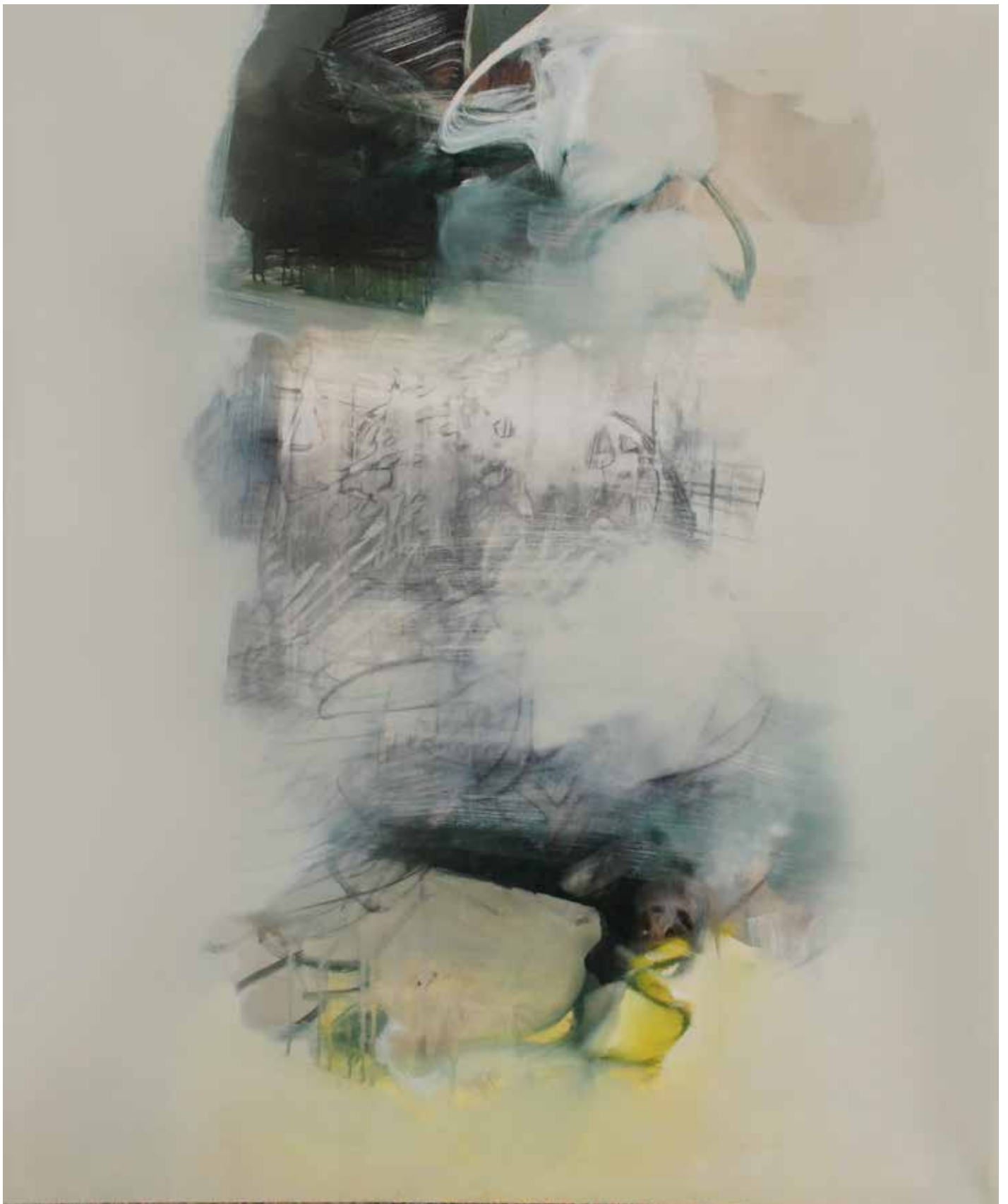
Senza rumore , 2016. Olio su tela, 120x100 cm