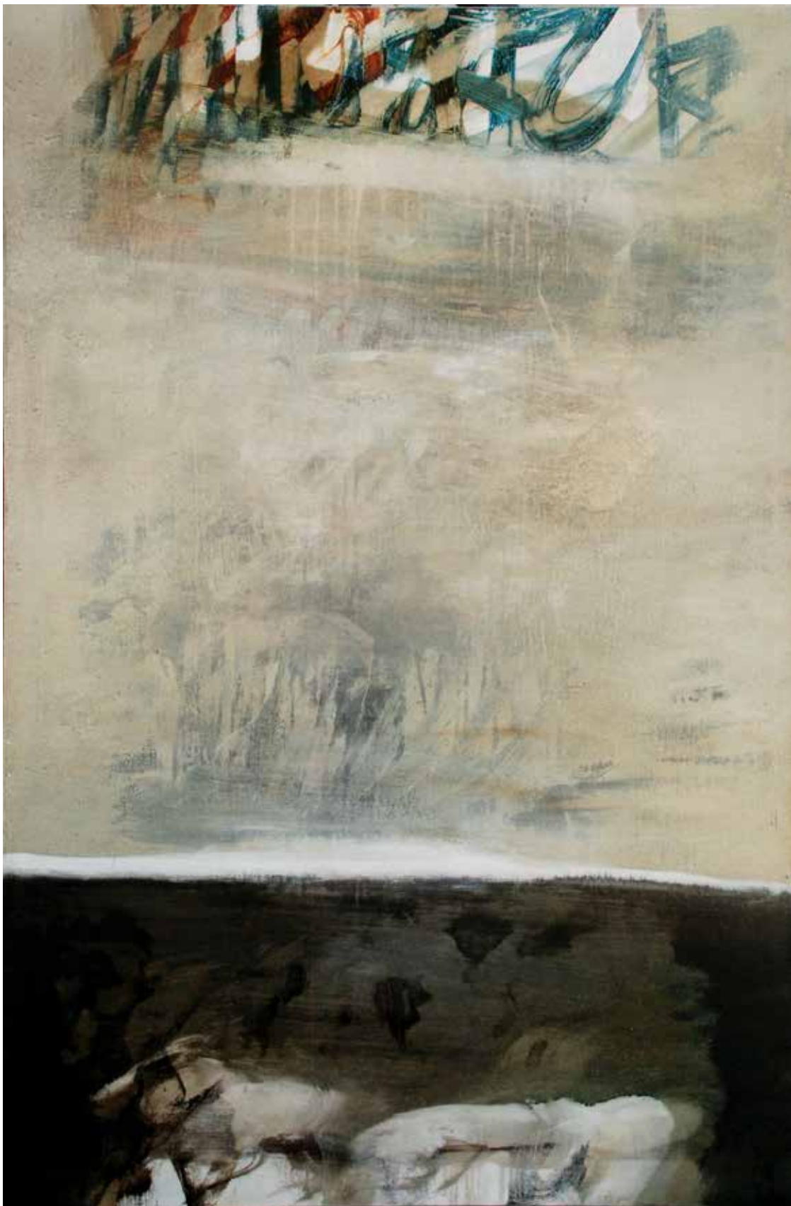
Apnea 1 , 2009. Tecnica mista su tela, 120x80 cm