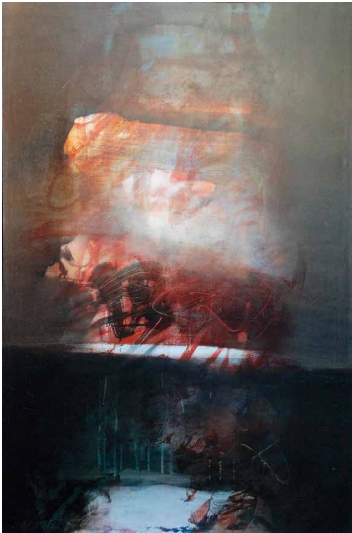
Apnea 2 , 2009. Tecnica mista su tela, 150x100 cm