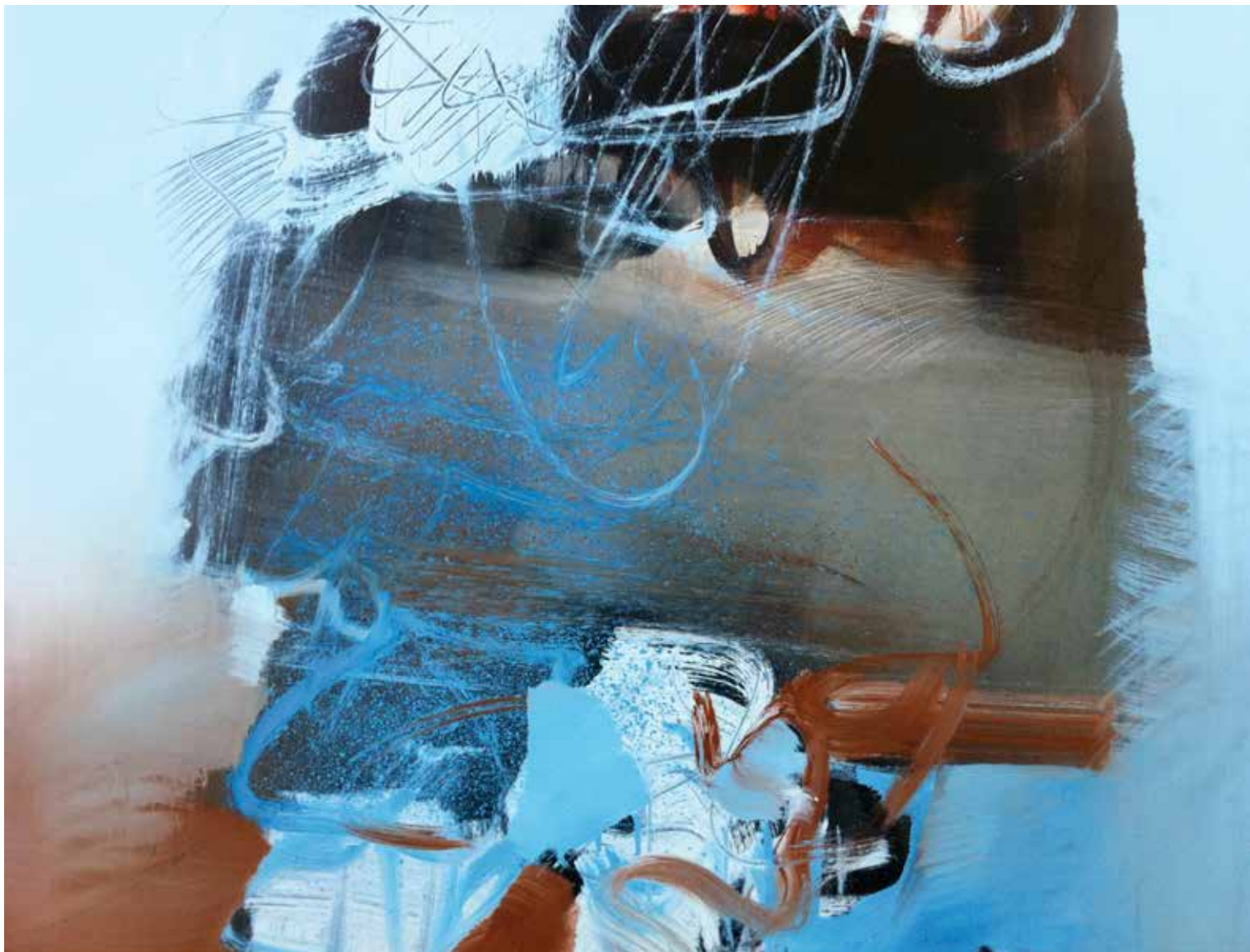
Strappo , 2013. Tecnica mista su tela, 70x80 cm