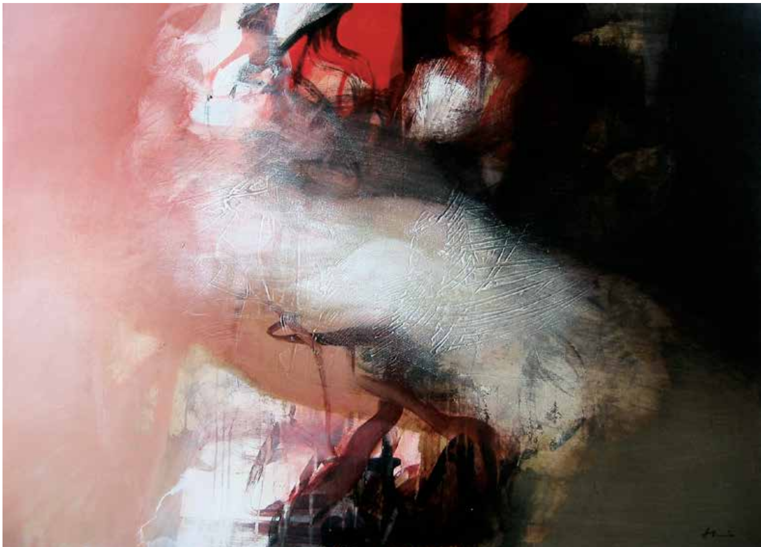
Strato rimosso , 2005. Tecnica mista su tela, 100x140 cm