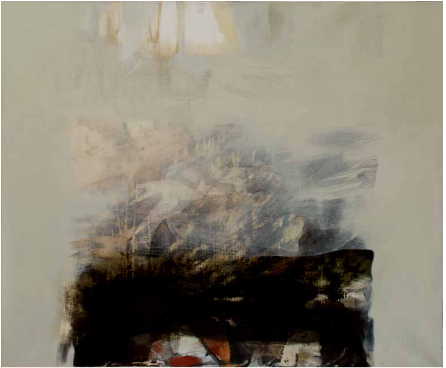
Tacite atmosfere , 2010. Tecnica mista su tela, 100x120 cm