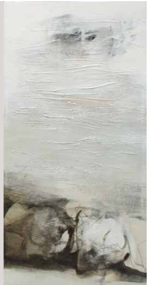
Fotogramma d'inverno - dittico - 2013. Tecnica mista su tela, 110x110 cm+ 110x55 cm