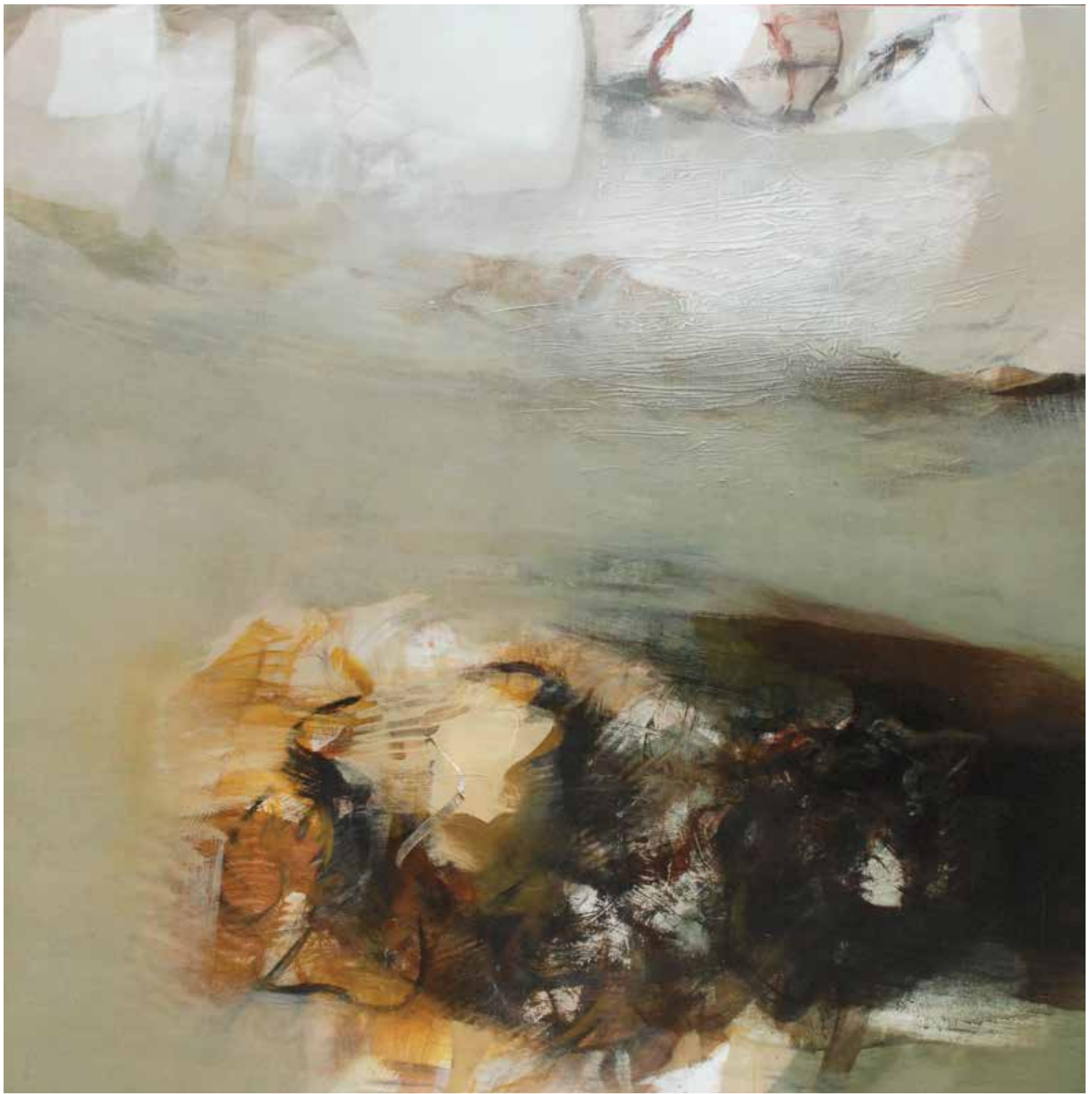
Aria d'autunno , 2013. Tecnica mista su tela, 150x150 cm