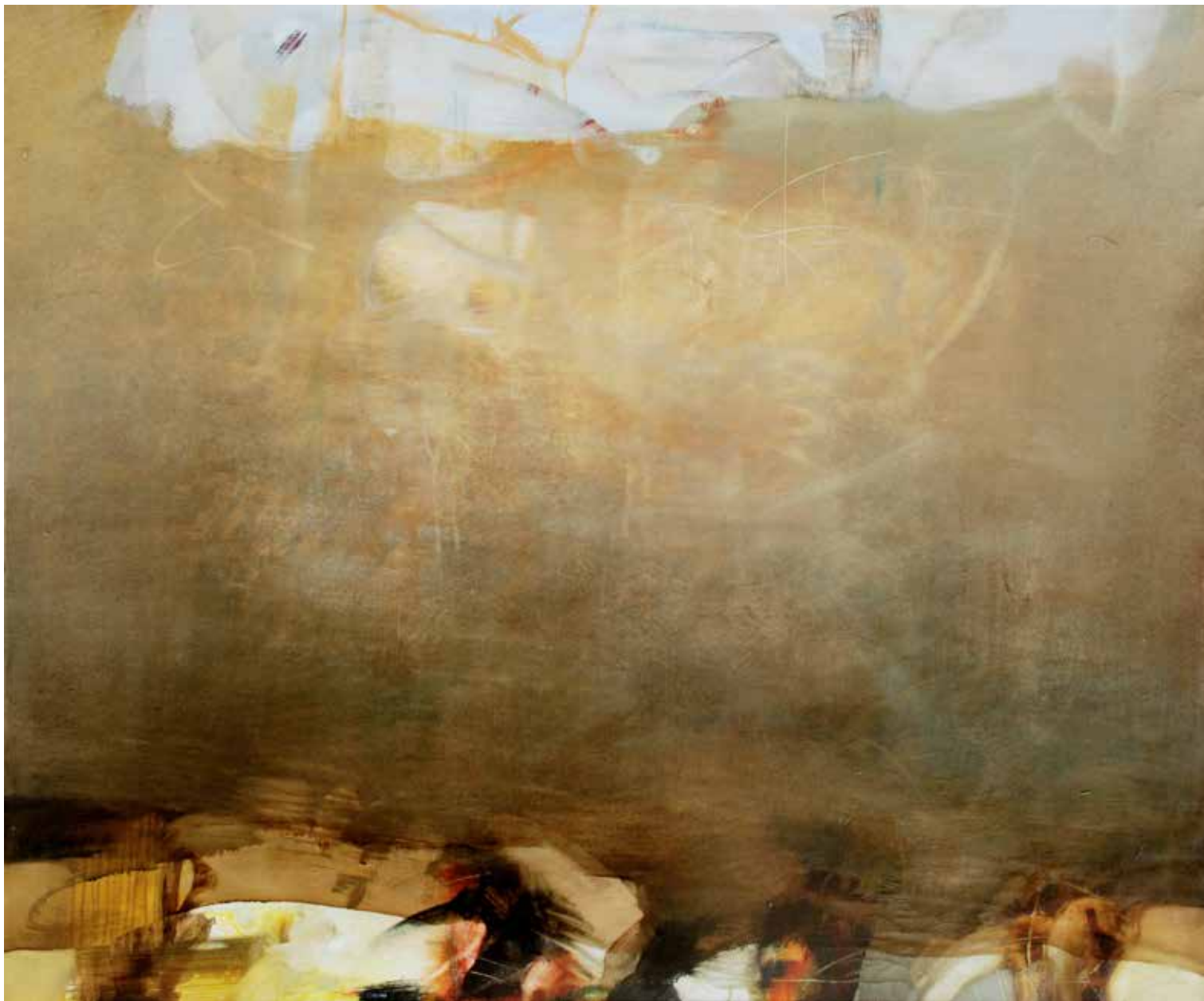
Senza rumore , 2008. Tecnica mista su tela, 100x120 cm