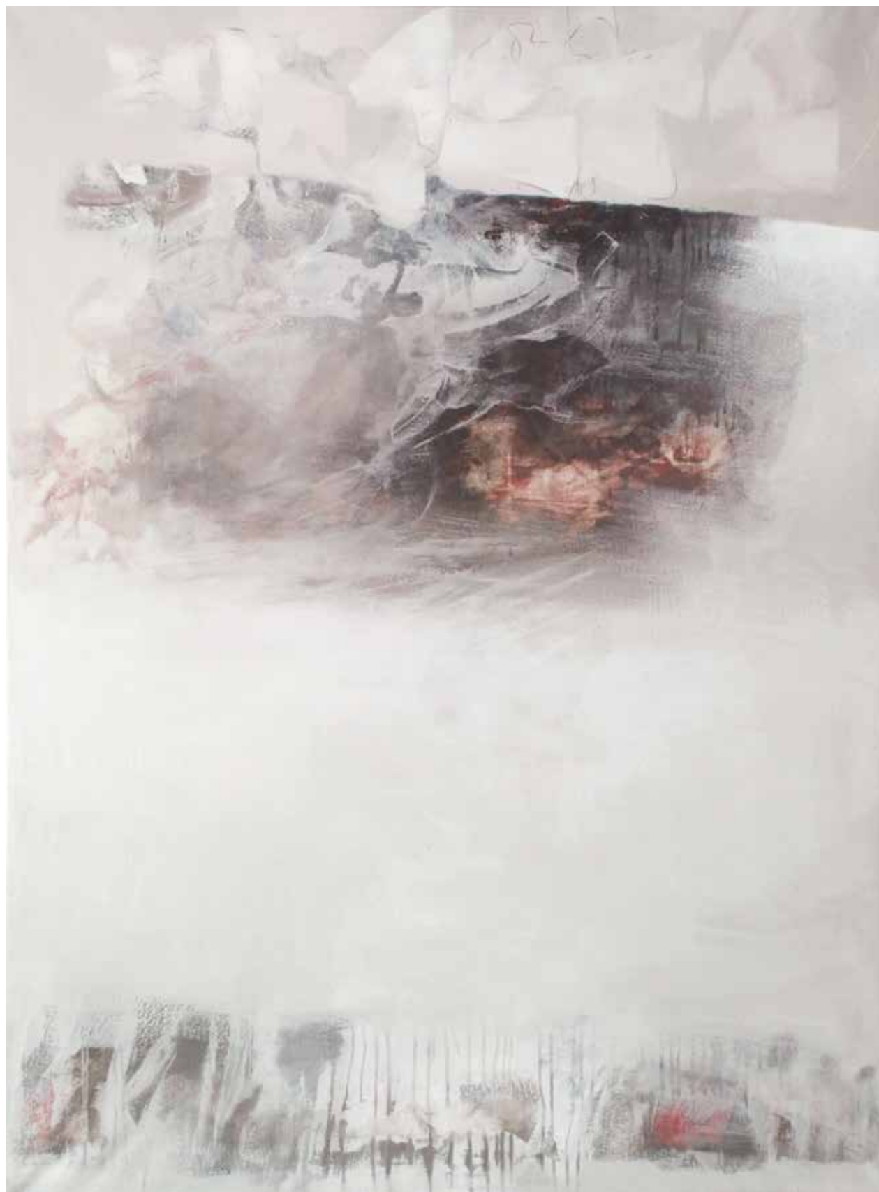
Improvvisa nevicata , 2013. Acrilico su tela, 165x123 cm