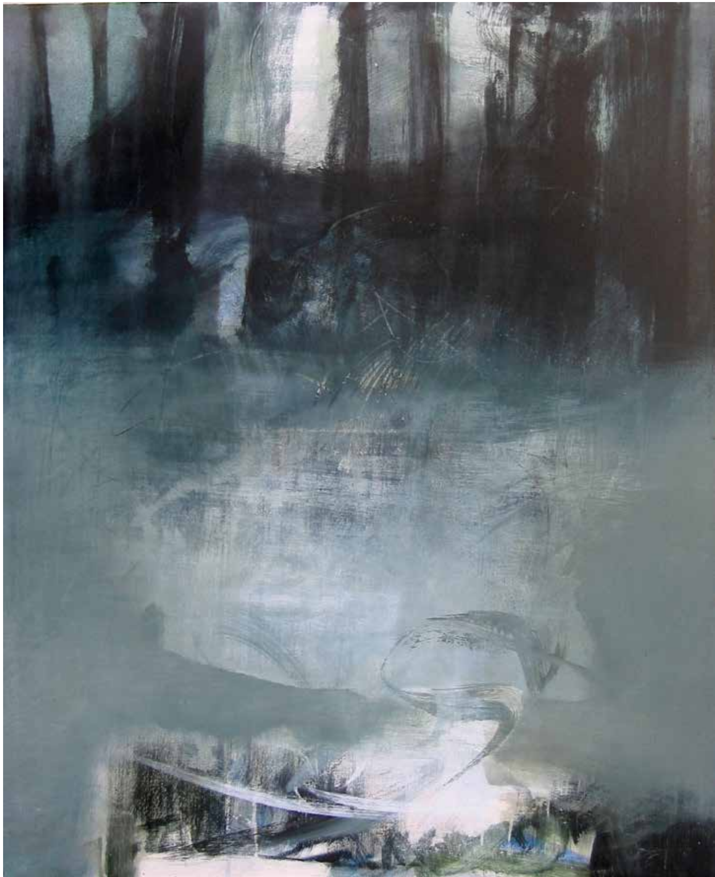
Il giusto peso , 2006. Tecnica mista su tela, 111x90 cm