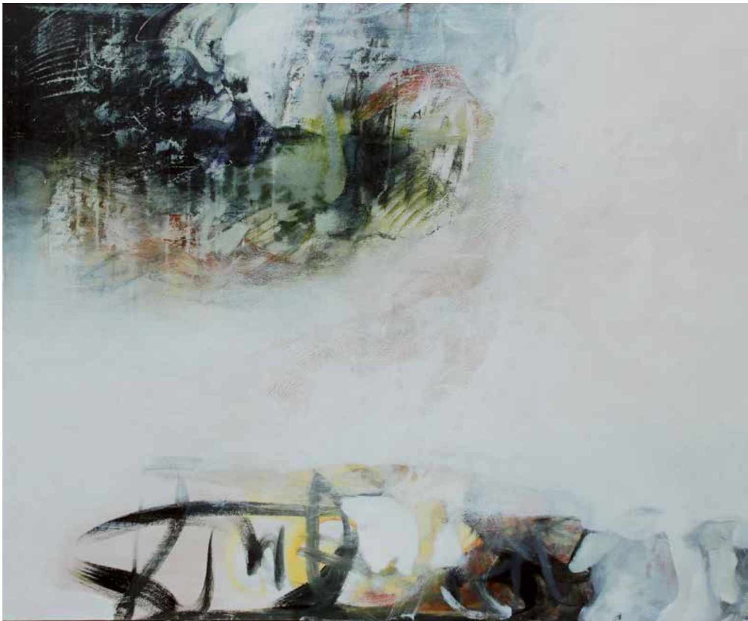
Fotogramma d'inverno, 2016. Acrilico su tela, 100x120 cm