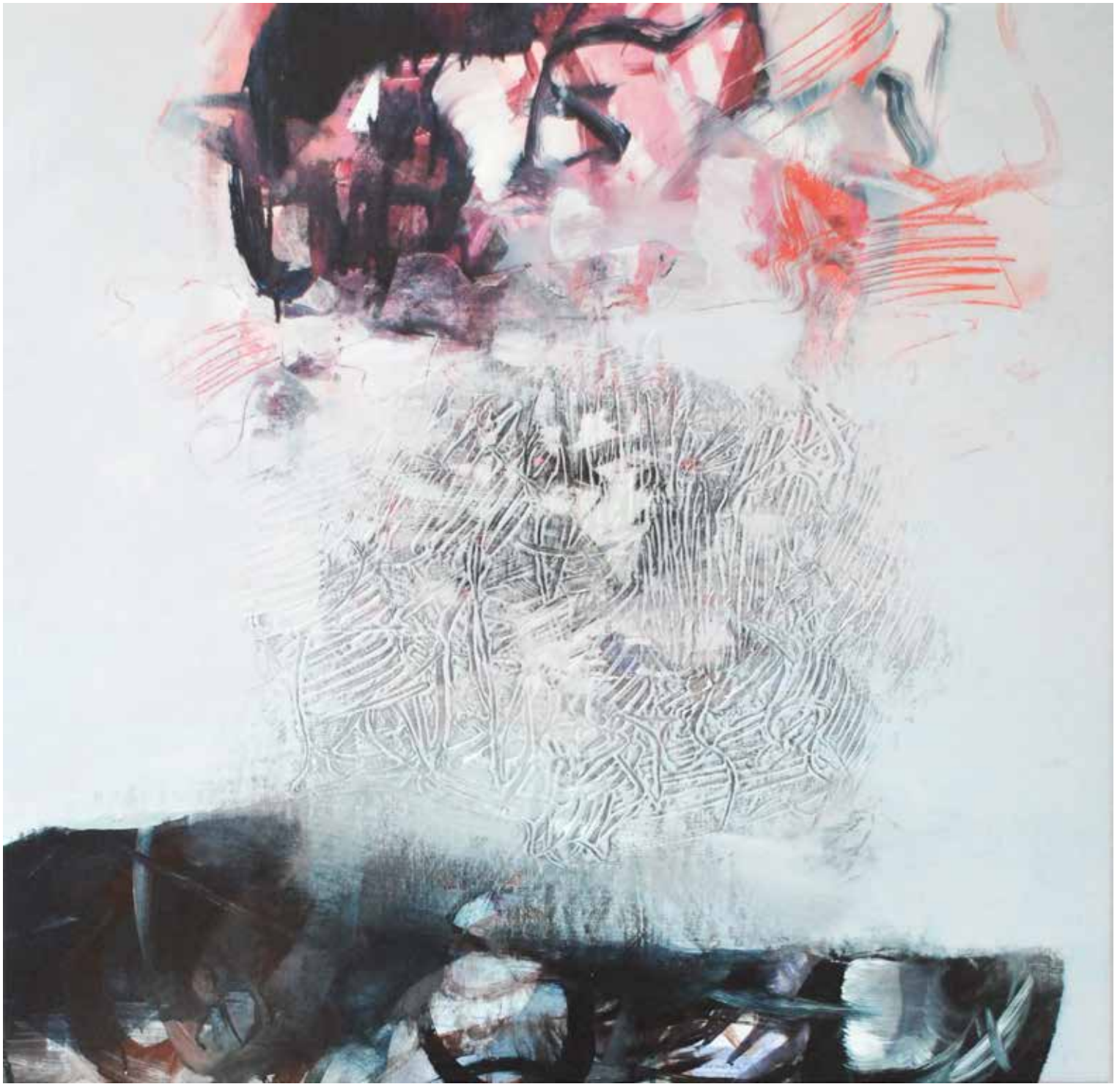
Fotogramma d'inverno , 2013. Tecnica mista su tela - 68,5x71,5 cm copia